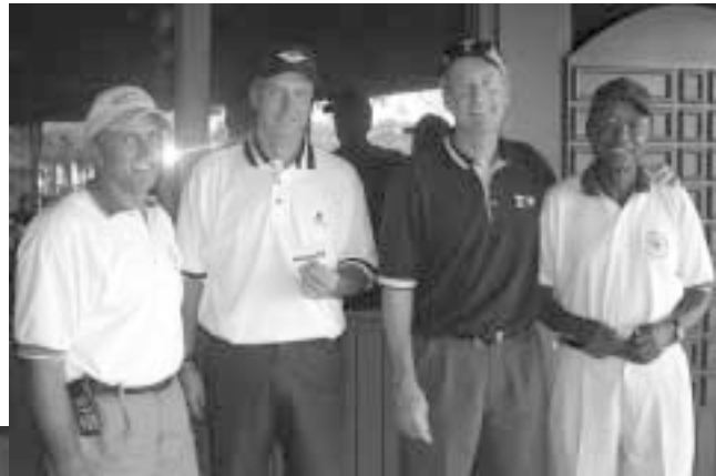
Golf outing "Real Winners" low score