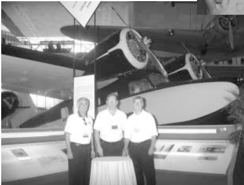
Conference attendees enjoying the Smithsonian