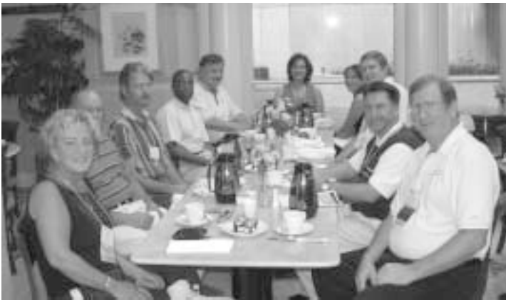
"First Timers" breakfast