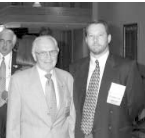
Attendees enjoying the final banquet