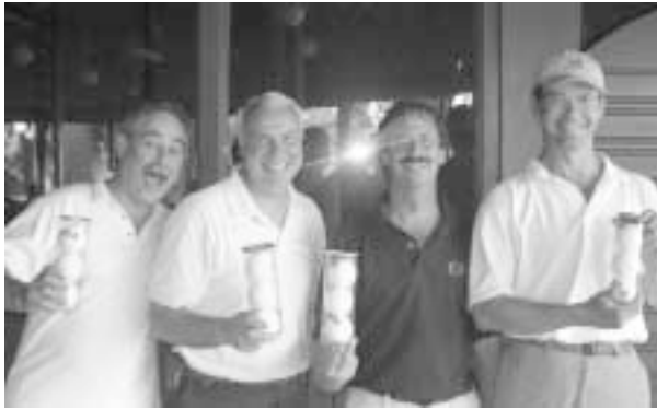
Golf outing HIGH score winners